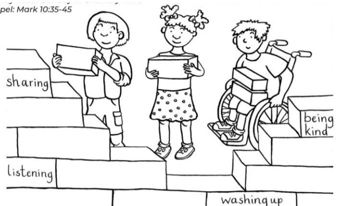
Gospel: Mark 10:35-45

What will you do this week to help others around the world?